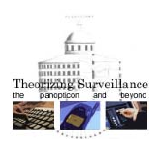
Theorizing Surveillance: The Panopticon and Beyond 12-14 May 2005

The May workshop was preceded by a collaborators' meeting and a meeting of the editorial board of the online journal Surveillance and Society .