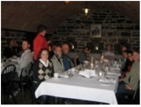
SSSS Banquet Dinner at Fort Henry in Kingston