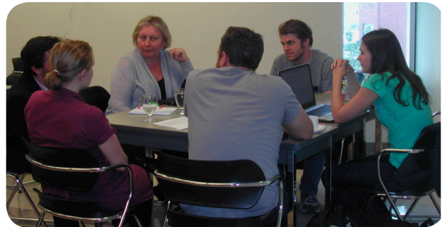
Surveillance Studies Summer Seminar

Our concern with surveillance is broad, covering everything from street cameras to the currently controversial question of police and intelligence access to internet data (Bill C-30). We